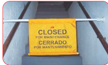
Blocks doorway or halls from 30" to 53" wide for cleaning or maintenance