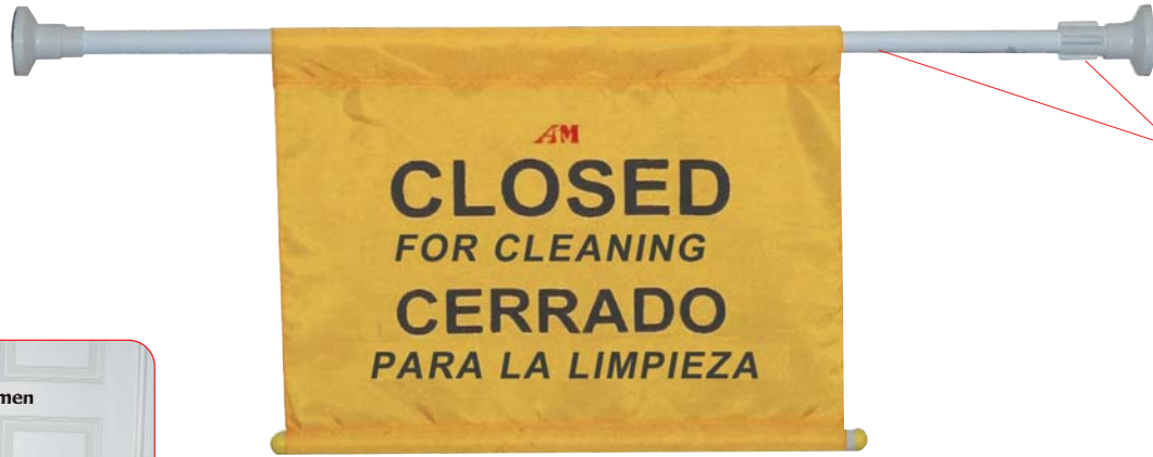
Unique Double-Lock Design